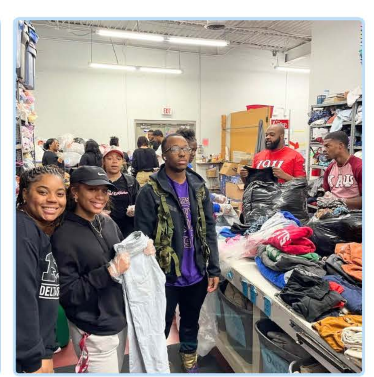
We're honored to have served with these groups in celebration of 115 years of the NAACP! *